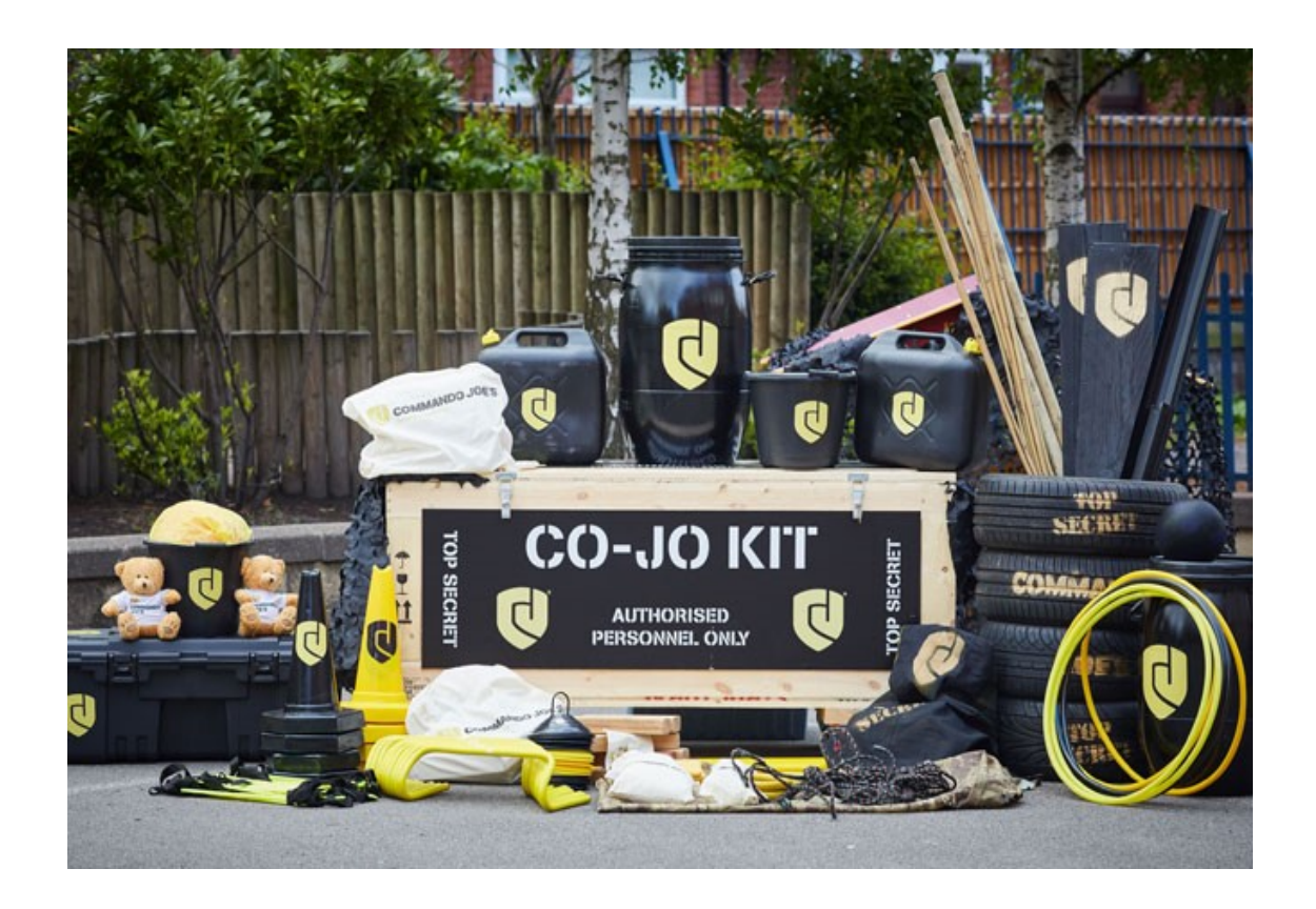
Our Top Secret Commando Joes kit arrived.

Last week we received a surprise package that had been parachuted into our grounds. This was our Commando Joes resources.